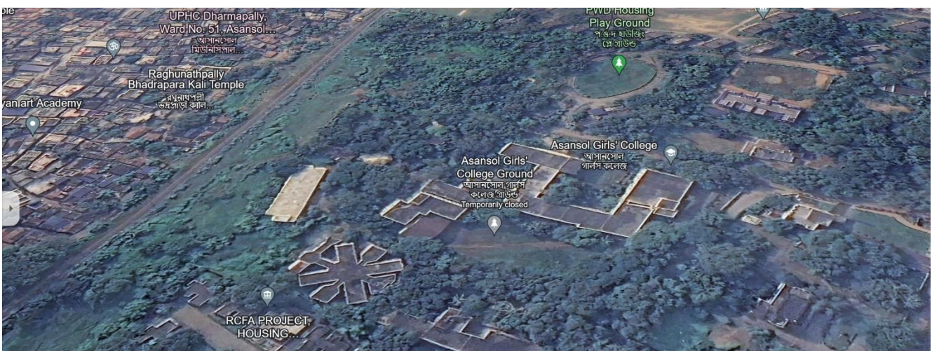
@ Google Earth picture of Asansol Girls' College