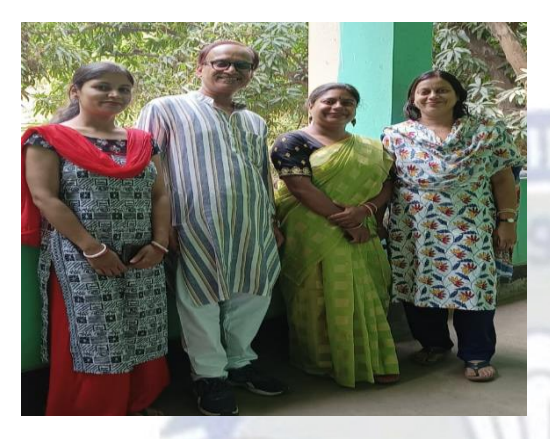
Departmental group photo