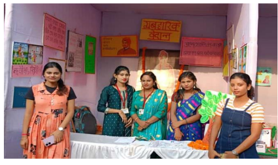
Departmental Stall in Social