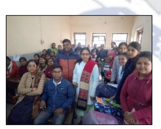
Faculty member with students