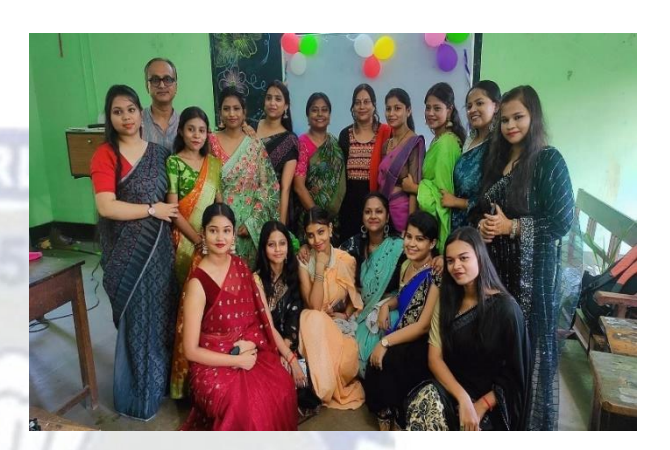
Departmental group photo with students