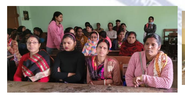
Departmental Photo with Students--